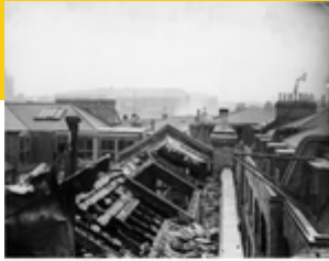
How the Triangle Shirtwaist Factory fire transformed labor laws and protected workers' health

The fire and its aftermath is a big reason American factories and offices are now far safer than they once were only a century ago.