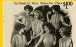
What is a Shirtwaist? | American Experience

https://ecommons.cornell.edu/item/s/cacb1604-9e77-42bb-af35-05910845d450