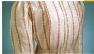
What you may not know about the Triangle shirtwaist factory fire