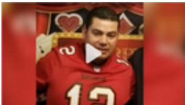
An international tragedy: A father of 3 and a budding entrepreneur are among 6 victims of the Baltimore...