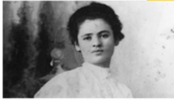
Clara Lemlich and the Uprising of the 20,000 | American Experience

This 23-year-old Ukrainian immigrant was the voice that helped incite the famous 1909 women's labor strike.