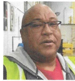
Ed Cole Chair DEI - Civil Rights